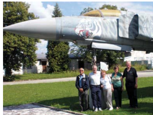
Above: the group poses in front of the Gate Guardian at Ceske Budovice This photo: camouflaged shelter at Ceske Budovice

Back on the Aero Club side of the airport we met up with others from Germany, Belgium and Switzerland who were going to join the fly-in. To clear Passport and Customs we had to taxi the aircraft to other