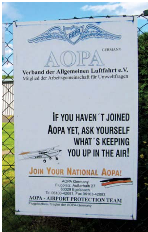
Above: fence notice at Aschaffenburg - well worth replicating across the UK? Top right: arrival at Aschaffenburg Right: Johannsburg Castle, Aschaffenburg Bottom: on approach to Ceske Budovice's 2500 metre runway