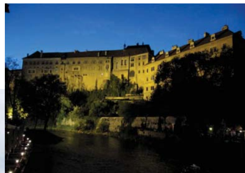
Right: Cesky Krumlov Castle at night Below: Market Square at Cesky Krumlov