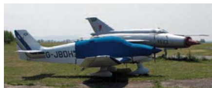
Left: a somewhat faster apron companion for the Robin

We decided to get on our way immediately to take advantage of the good weather and open up the possibility of getting home that day. The flight to Munster should have been relatively straightforward going to the north of Leipzig. After dodging a few showers however we met a solid wall of heavy rain. A 20 mile diversion to the south, over the Harz Mountains, solved the problem. At Munster we made the decision to refuel and then check the weather. The UK forecast made our decision an easy one. Monday was to be a day of low cloud and showers. Sunday, late afternoon and early evening, was to be good on both sides of the North Sea. We filed a flight plan and had a late lunch in the main terminal. Kitted out in our survival suits and life jackets we then got on our way. Apart from the continuing headwind we had a straightforward flight on to Holland and