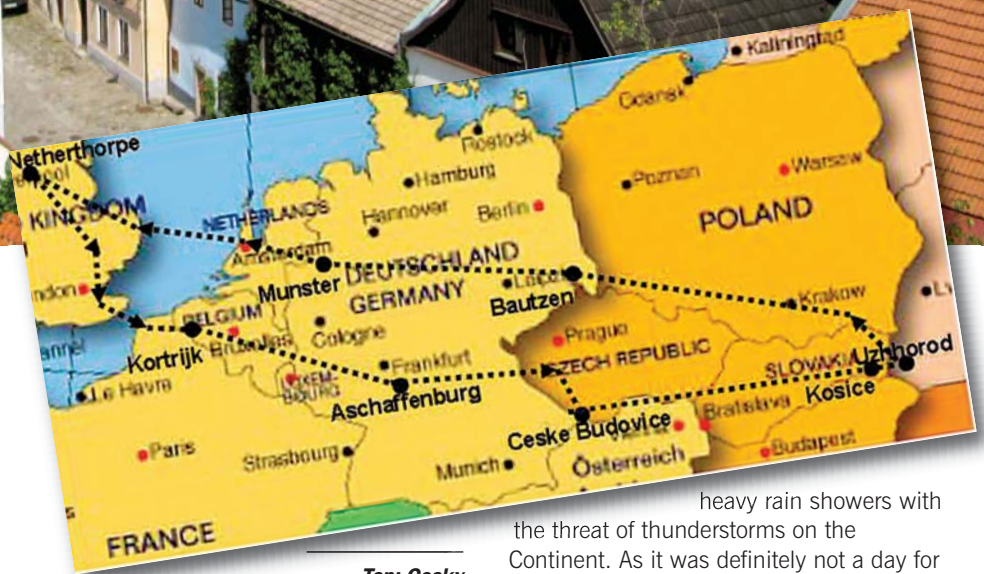
Top: Cesky Krumlov, seen from the castle Above: our route through Europe

In the same newsletter, AOPA Ukraine announced a summer fly-in at Uzhhorod, near the Slovakian border. This was to be a joint event involving AOPA, Uzhhorod Airport, the Padonki International Motorcycle Club and the Ukraine Development Institute of Flight Technologies. It promised a long weekend of excursions and entertainments. An attractive alternative to Malta, we decided. The Italians later relented on the tax, but by then we were committed to the Ukraine.