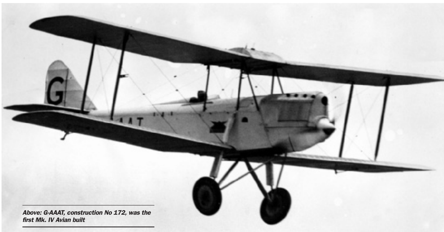
Above: G-AAAT, construction No 172, was the first Mk. IV Avian built

called balanced flight) played a major part in the turning process. This, of course, is much more satisfying than the present-day turn carried out almost on aileron alone.