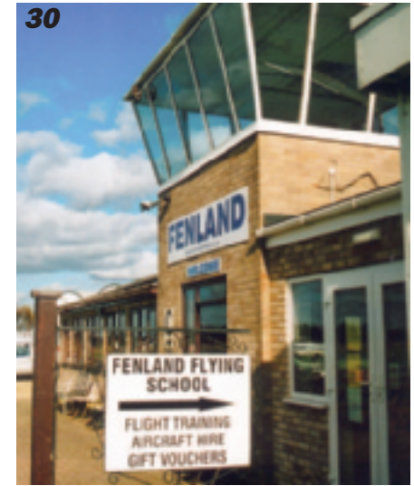
General Aviation February 2009