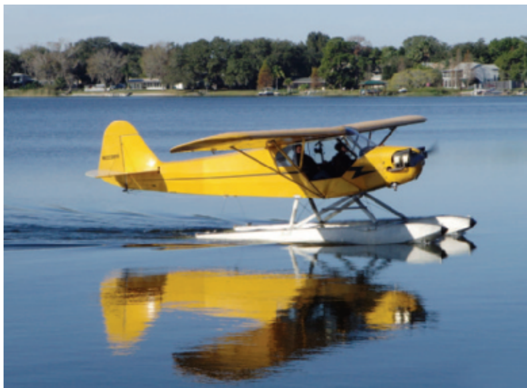
This photo: slightly choppy water helps ensure the floats will unstick more quickly Below: flare at 15 feet and let the back of the floats touch first Bottom: floatplane flying is a fabulous experience and a challenge you can't turn down Lower left: sunrise over the lake as Steve gets ready for another flight in the Cub