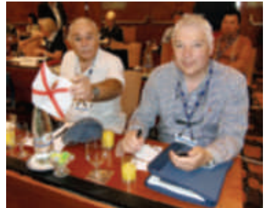
Above: at the IAOPA World Assembly Charles, as always, flying the flag for Jersey CI Left: Herzliya Airport, Israel's only dedicated GA airport, is under threat from developers