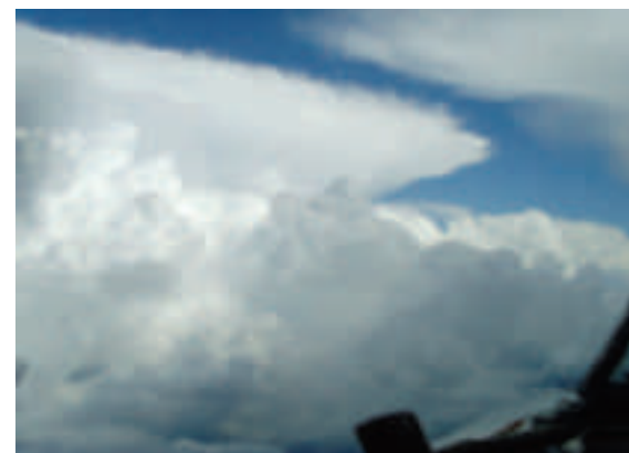
Above left: Dubrovnik's beautiful harbour Left: on finals for Kerkira, Corfu Above: some anvil heads en route to Rhodes