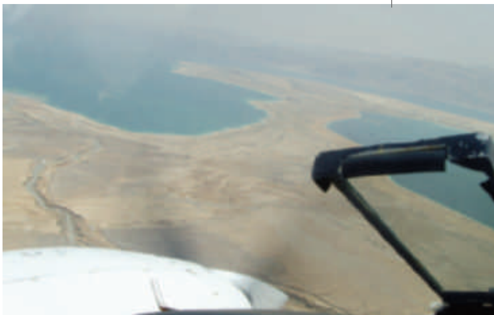
Above: the Dead Sea, shrinking by one metre a year Left: the altimeter reads minus 1,200 feet after landing at the world's lowest airport, Masada Lower left: the terminal building at Masada took the form of a Bedouin tent Bottom: the airfield at Masada, seen from the top of the Rock Bottom right: back in Jersey, crabbing home in a crosswind gusting 29 knots