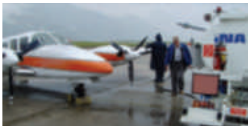
Top: en-route IFR charts purchased from Jeppesen. Note the unique AOPA cap with built-in sunglasses and LED lights. Left: rainy Dubrovnik – we always refuelled on arrival to avoid delays next day Below left: awaiting the arrival of the ferry Below: awaiting dinner at The Nautica with eager anticipation and enjoying the majestic view of Dubrovnik from its outside balcony