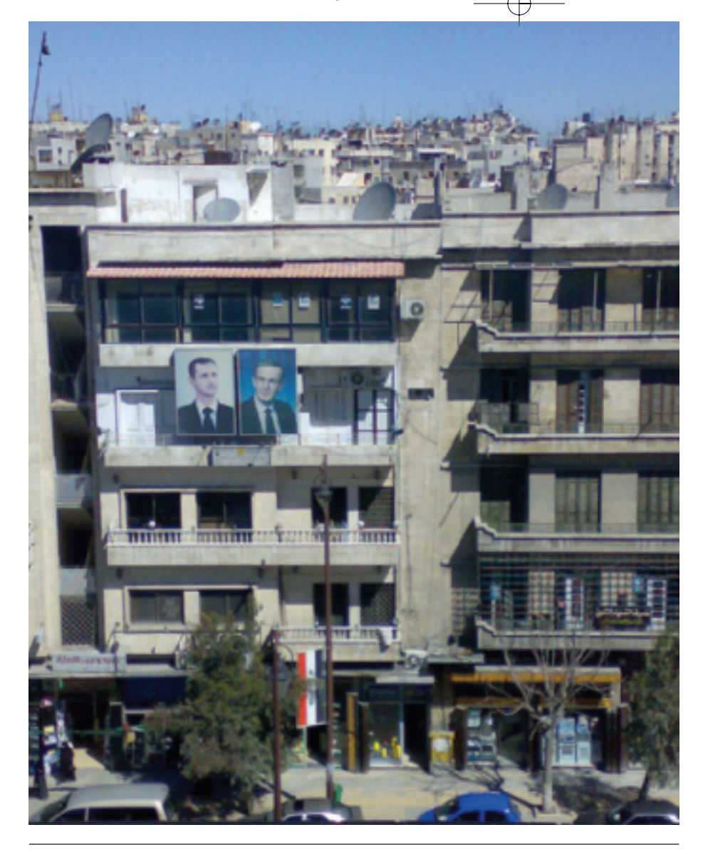
Left: night stop in Aleppo, Syria, where women pilots are rare Below: view from the office window - this happens to be in the hold over London Right: the view from final approach into Jersey is pretty special