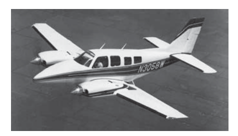
Hawker Beechcraft, makers of the Baron, have woken up to the sales threat represented by EASA's accelerate-stop rule

now is to try to get the Parliament to reject it now, although the Parliament doesn't have a lot of say in these matters. It's a lastditch attempt to stave it off."