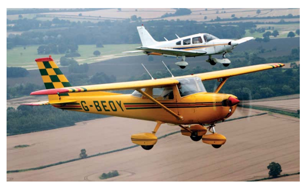
on September 1st by staging the 'UK Diabetes Formation Flight' in which six pilots with insulin treated diabetes, all