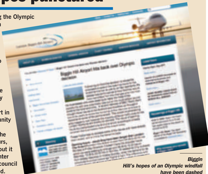
Biggin Hill's hopes of an Olympic windfall have been dashed

"Our way ahead now is to make the best of the Olympics opportunities that remain."