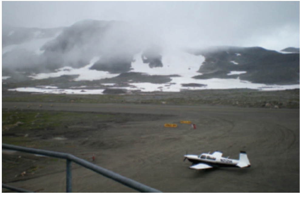
Top: the Mooney's wing spoilers are useful for dumping height on approach Above: Ice, bad weather, small plane, big world - the Mooney at Kulusuk Below: the tricky Faeroes approach down this fjord avoids having to land in the UK