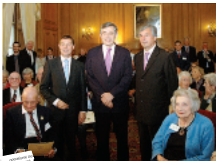
Above: Nigel Griffiths MP, Prime Minister Gordon Brown and Aviation Minister Jim Fitzpatrick at the ATA Veterans Badge ceremony

Mr Griffiths, a close friend and informal spokesman for Gordon Brown, urged the Prime Minister to act, and with lightning speed by Whitehall standards it was decided that a special honour should be conferred. In February, Transport Secretary Ruth Kelly announced that a Veterans Badge would be awarded to surviving members of the ATA in recognition of their work. The ATA was responsible for ferrying over 300,000 aircraft