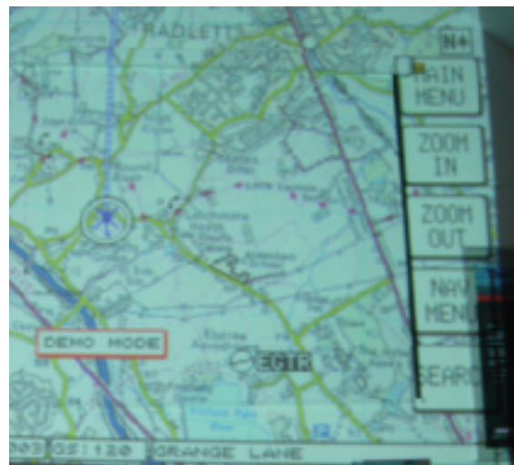
Above: GPS will be demonstrated at Cranfield

The day starts at 10:30am, and there will be coffee and a buffet lunch. Cost to members is £10, to guests £15. They expect to finish around 3:30pm.