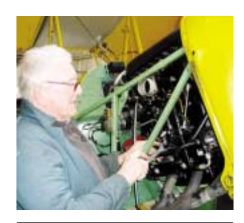
Implementing Rules on Maintenance - IR(M) - promised a light touch, but the reality was very different

the end result, which the Parliament will no doubt nod through – we've got to play the googlies when they are bowled. In this we are lucky to have as an MEP