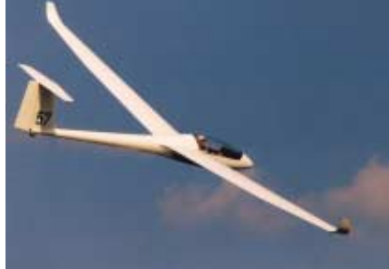
Left: document says there are approximately 300,000 pilots and 80,000 aircraft in Europe, although some countries keep no figures Above: 'light touch' regulation for gliding in Germany has led to a vibrant manufacturing scene with significant export potential Below left: the simplified regulatory regime for microlights has also helped foster massive growth without an unacceptable reduction in safety

It adds: "In the microlight world, with an extremely simplified regulatory regime, the data available to the group do not show a significant difference with the traditional sector of General Aviation in spite of the lighter regulatory regime. The causes of accidents seem to be no different from those of aircraft regulated in the 'classic' manner.