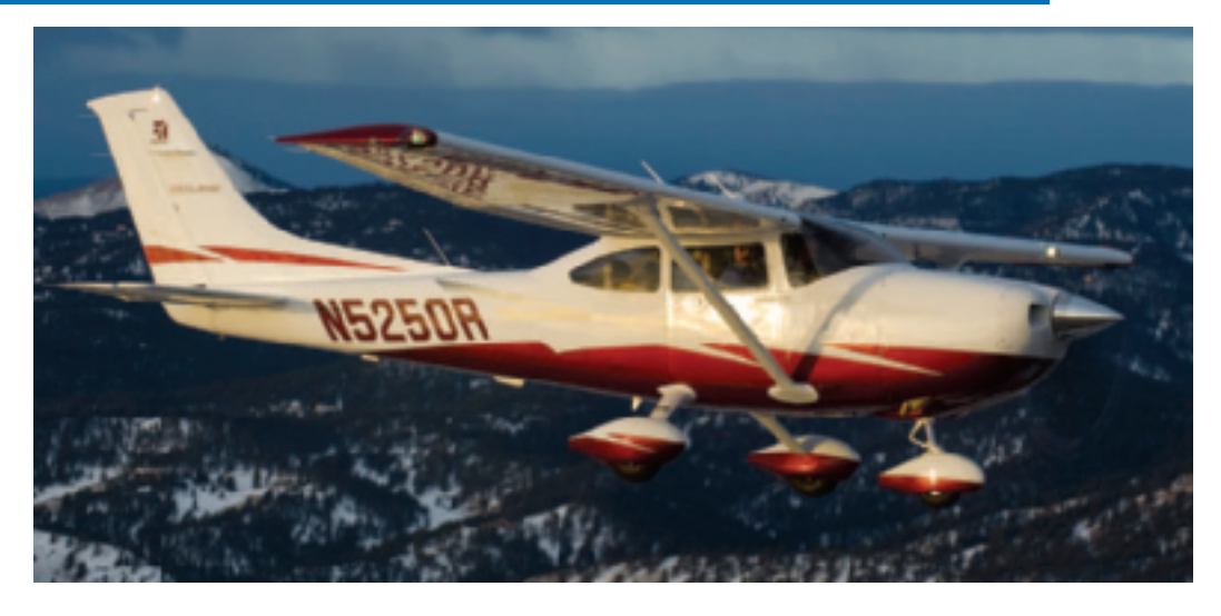
Above: N-registration operators may only have been given a two-year stay of execution

At its December meeting the EASA Comitology Committee, the body which approves EASA's decisions before they go to the European Commission, postponed from 2012 to 2014 the adoption of EASA's proposals on third country licensing. In the meantime the committee hopes the matter can be dealt with by way of bilateral agreements between Europe and America. In fact the first bilateral - known as a BASA – is due in spring, although it makes no mention of licensing. The hope is that once it is signed, flight crew licensing agreements can be added later by way of annexes. Unfortunately the negotiations on bilaterals have been characterised by inertia, obstruction and dogged pursuit of