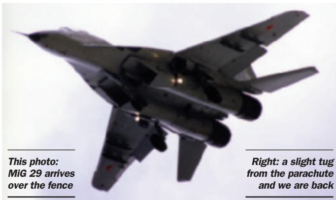
This photo: MiG 29 arrives over the fence

Everyone in Russia worked very hard to make my trip a success. I can thoroughly recommend it. ■