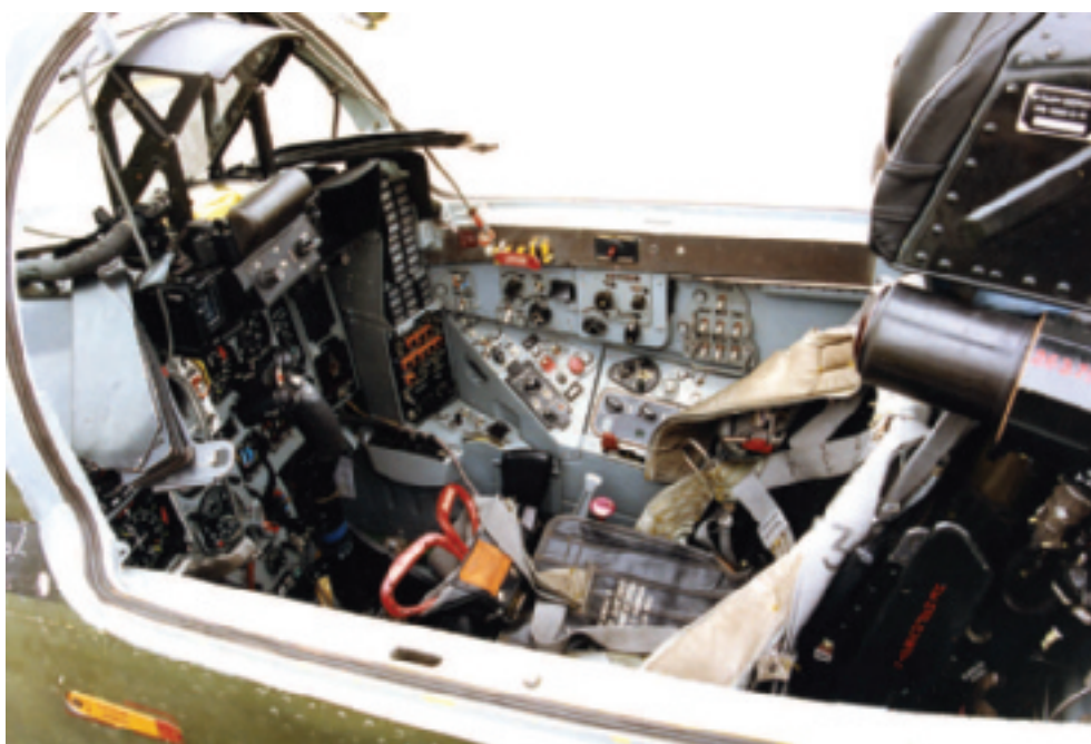
Peter R March

on the brakes. 'OK John?' 'Affirm,' - and we're off. Rain quickly off the canopy – feels racing car fast, rotate after a short distance as you would expect followed by a gently banked turn and now climbing quite steeply into the cloudbase. A bit of afterburner to get through the cloud cover and we pop out into the sunshine at 6,000 ft. The instruments are calibrated in metric so ongoing mental arithmetic is the order of the day. We have to go 170 km to the 'play area' so I use this time to really get my head around the instruments in order to know what is going on. In a few minutes Yuri announces we have arrived; I am quite pleased with myself that I have picked this up on the DME. I suspect these guys get bored easily, because the MiG's attitude indicator is soon in funny places doing a 180 and Yuri announces we are going to go supersonic. Watch the mach indicator go