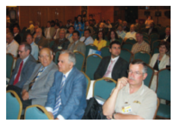
Above: AOPA delegates from 26 countries flew to Athens for the 24th World Assembly and Icarus Aero Expo Left: Greece sees a future in which GA tourists island-hop around the Aegean the way they now hop to the Bahamas or the Keys

sponsored, and it would have cost a lot of money. There had to be a better way."