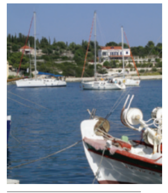
Above: we have hundreds of islands – there are thousands of pleasure boats out there

She told the World Assembly: "The centre of gravity of European general aviation is moving inexorably south. Most is now in western and central Europe – the UK, Germany, France. But the next generation of pilots will be trained in the south. We have enormous potential. It used to be virtually impossible to fly in Greece. A Greek licence simply wasn't accepted in Germany, for instance. But three years ago the first flying school moved to Greece and doubled the number of GA movements overnight.