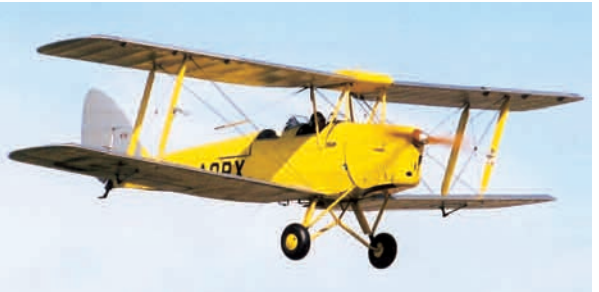
Top: London's Battersea Heliport sits at the centre of the Prohibited Area Above: arrangements must be made for classic aircraft with no transponder

"Together with NATS and the MoD we will be gathering as much information as we can, and we will be visiting airfields and giving briefings to explain the position to flying clubs and pilots in and around the restricted areas."