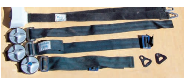
Above: seat belts in GA aircraft get a tiny proportion of the wear they are subjected to on commercial jets

years, or approximately 2,500 hours, when the seat belt manufacturer designed these for two orders of magnitude longer life (maybe it was something to do with the spate of frivolous litigious claims following accidents that plagued GA aircraft manufacturers a few decades ago?) You might think, well, surely, the aircraft manufacturers are being unduly pessimistic, so let's go with the seat belt makers. But, in the UK anyway, the LAMP (CAP 766 Light Aircraft Maintenance