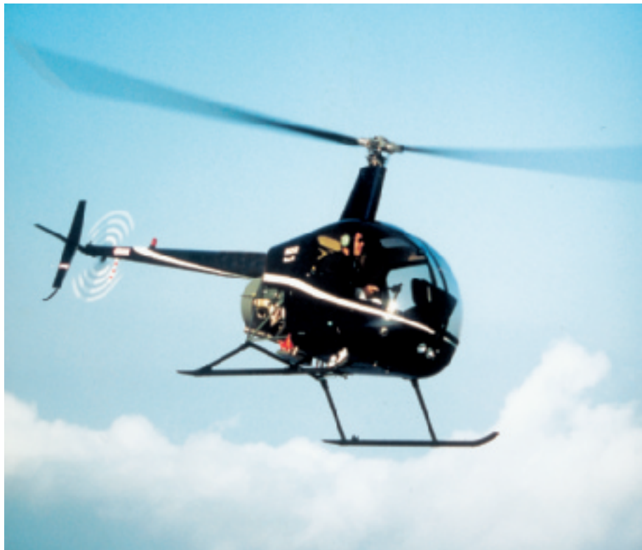
This is a Twin Squirrel, as you may plainly see

I'll have to bring in about £170,000 worth of business just to pay my Day One CAA fees