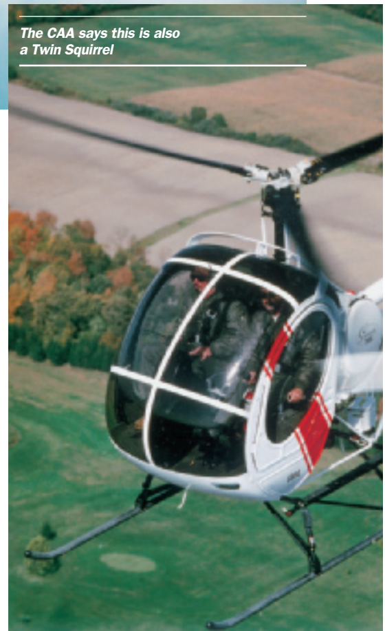
The CAA says this is also a Twin Squirrel

£10,000, before I've even turned a blade. Let's say I'm as successful as the CAA, which is required by law to make a six percent