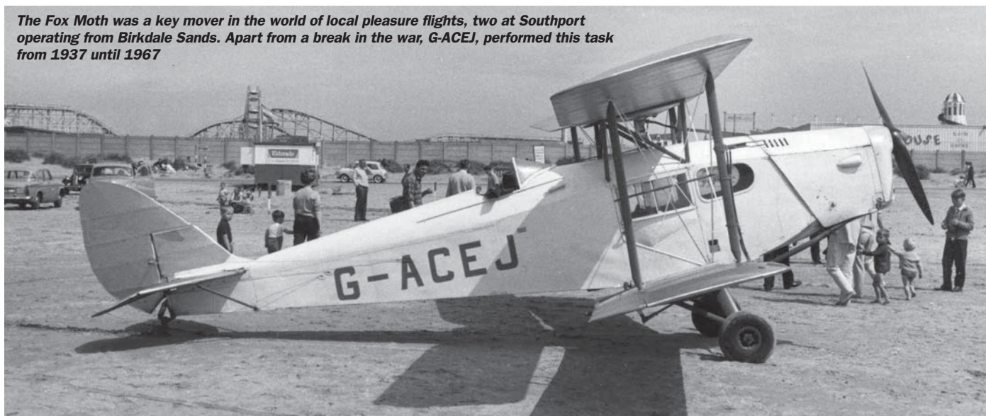
The Fox Moth was a key mover in the world of local pleasure flights, two at Southport operating from Birkdale Sands. Apart from a break in the war, G-ACEJ, performed this task from 1937 until 1967

provided by high-compression Gipsy Major ICs. In general assessment the Fox Moth was the result of a stroke of genius by its designer A E Hagg, who successfully created a very efficient five-seat machine of clearly commercial significance, all behind the economy (and reliability) of an engine used mainly on elementary trainers. Without doubt, the DH83 deservedly became more widely known than its production numbers might suggest, for it had a varied working life that was unique in its field. ■