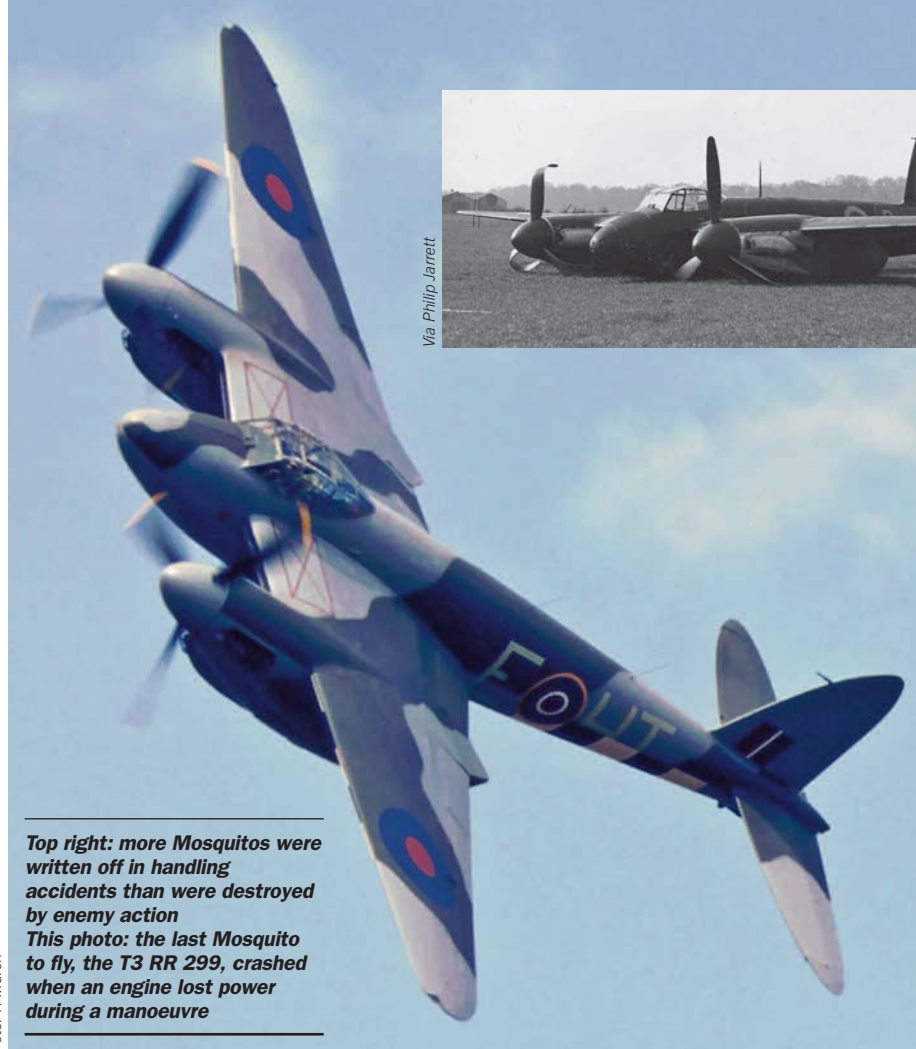
Top right: more Mosquitos were written off in handling accidents than were destroyed by enemy action This photo: the last Mosquito to fly, the T3 RR 299, crashed when an engine lost power during a manoeuvre

There are a few very good and famous historic aeroplanes that perhaps should not be flown again. No one could be keener than I am to see and listen again to a Mosquito in flight, so perhaps I should be