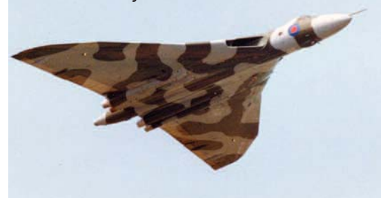
When Avro Vulcan WB 588 took to the air, the author confessed that his initial judgement had been seriously flawed

So, what is my humble verdict? Historic aeroplanes which are within reach of today's piloting and engineering skills (by far the majority) should be flown under strictly controlled conditions, but a few types may best serve by remaining on static view. I accept that some readers may disagree, but I base my judgement on a few years of activity in the field. Opposing views are welcome! ■